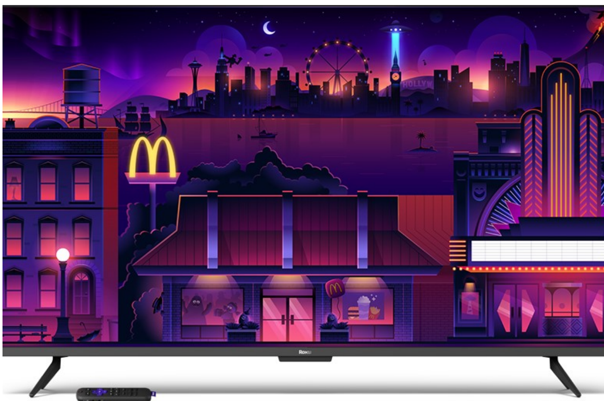
Roku City Experience: McDonald's

In May, we hosted our second in-person NewFront event in New York showcasing Roku's scale, technology, and differentiation, as well as introducing clients to Roku programming talent including Sofia Vergara, Weird Al Yankovic, Rich Eisen, and Charlie Puth. With our Primetime Reach Guarantee, advertisers can reach more TV households in primetime on Roku than the average program airing on a top-five cable network 4 . For the first time, Roku City was opened for major brand advertisers, such as McDonald's and Mattel, which have integrated brand-specific visuals into our iconic screen saver, allowing them to reach consumers in a way that only Roku delivers. We have partnered with a few key advertisers in verticals beyond M&E to place ads on Roku's home screen, all while maintaining an outstanding streaming experience for viewers.