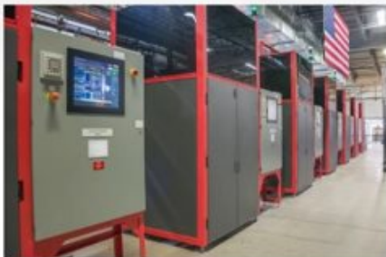
Advanced automated SiC crystal growth systems

Key material for next-generation semiconductors that significantly improve efficiency in electric vehicles (EVs), EV charging and energy infrastructure