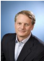
John J. Donahoe II

Mr. Cook, 57, a director since 2005, is the Company's Lead Independent Director and is the Chief Executive Officer of Apple, Inc. ("Apple"). Mr. Cook joined Apple in March 1998 as Senior Vice President of Worldwide Operations and also served as its Executive Vice President, Worldwide Sales and Operations and Chief Operating Officer. Mr. Cook was Vice President, Corporate Materials for Compaq Computer Corporation from 1997 to 1998. Previous to his work at Compaq, Mr. Cook served in the positions of Senior Vice President Fulfillment and Chief Operating Officer of the Reseller Division at Intelligent Electronics from 1994 to 1997. Mr. Cook also worked for International Business Machines Corporation from 1983 to 1994, most recently as Director of North American Fulfillment. Mr. Cook is currently a member of the Board of Directors of the National Football Foundation and Apple. Mr. Cook also currently serves on the Board of Trustees for Duke University. Mr. Cook was selected to serve on the Board because his operational executive experience and his knowledge of technology, cyber security, marketing, and international business allow him to provide the Board with valuable perspectives and insights.