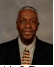
John R. Thompson, Jr.

Mr. Thompson, 76, a director since 1991, was head coach of the Georgetown University men's basketball team from 1972 until 1998. Mr. Thompson was head coach of the 1988 United States Olympic basketball team. He hosted a sports radio talk show in Washington, D.C. for 13 years, and is a nationally broadcast sports analyst for Turner Network Television (TNT) and Dial Global, Inc. He serves as Assistant to the President of Georgetown University for Urban Affairs and he is a past President of the National Association of Basketball Coaches and presently serves on its Board of Governors. Mr. Thompson has honorary doctorate degrees from Wheeling Jesuit University, Georgetown University, University of the District of Columbia, and St. Peter's College. Mr. Thompson was selected to serve on the Board because his extensive experience and knowledge of education, college and professional sports, media, broadcasting, and knowledge of urban issues allow him to provide valuable insights to the Board regarding sports marketing, corporate responsibility and diversity.