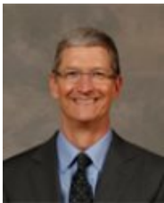
Timothy D. Cook