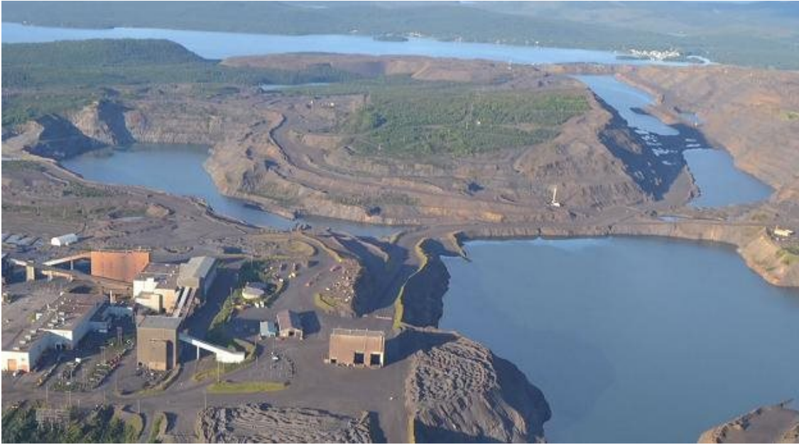
The Scully Iron Ore Mine

We are encouraged by the development of iron ore pricing and the production ramp up of the mine to date. The following is a three-year price chart of 62% iron ore.