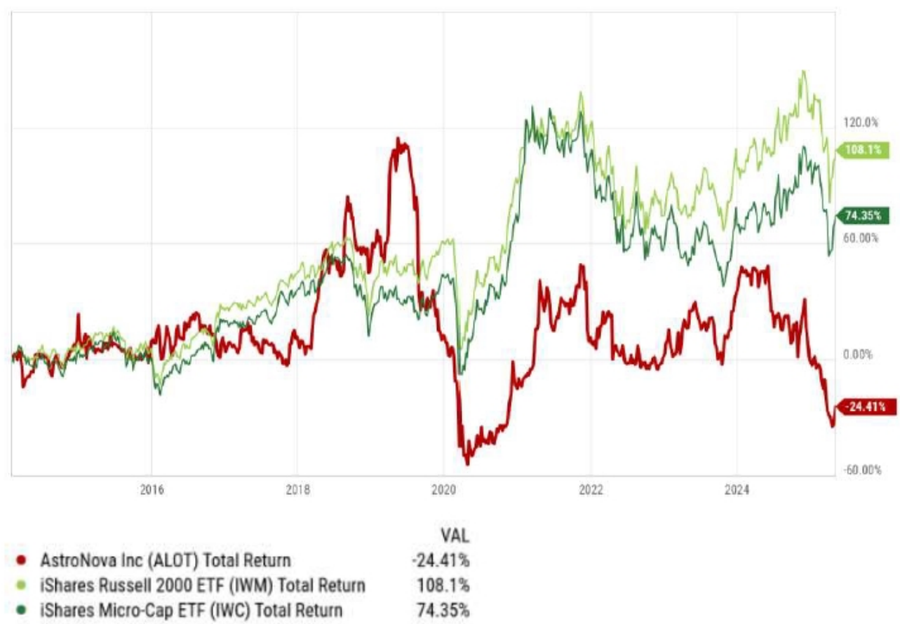
Figure 1: AstroNova vs. Small and Micro-Cap ETFs since Greg Woods Became CEO (February 1, 2014 through May 8, 2025)