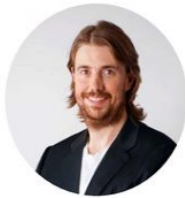
Mike Cannon-Brookes Co-founder and CEO

Photocopies. Email. Status meetings. When Atlassian was founded, these were the tools of workplace collaboration. Today, the problems teams are solving have become increasingly complex, and the teams themselves increasingly distributed.