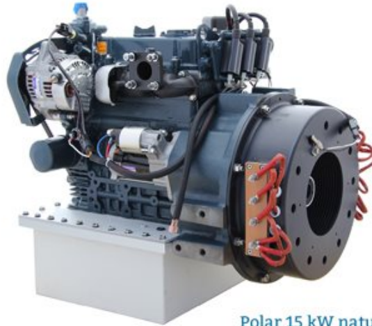
Polar 15 kW natural gas/propane DC generator