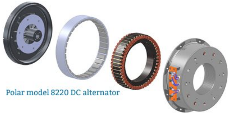
Polar model 8220 DC alternator