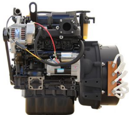
Polar 10 kW diesel DC generator