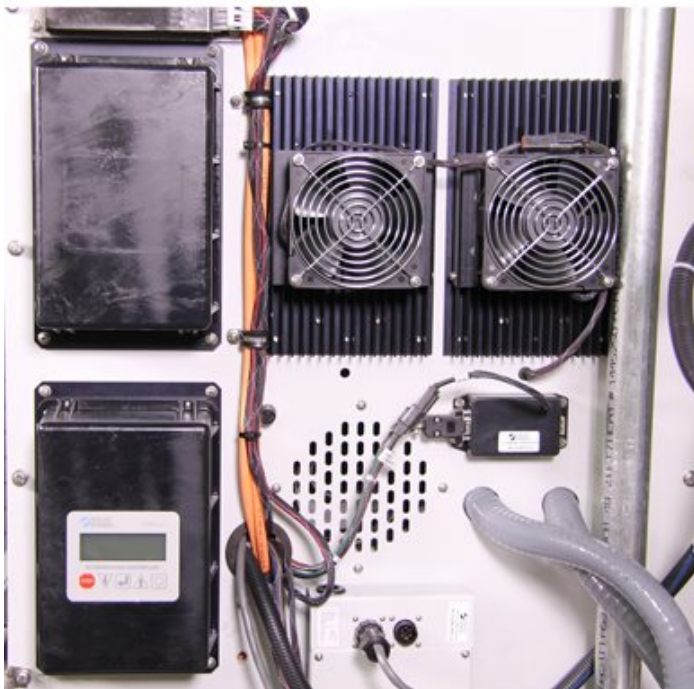
Polar Supra Control System