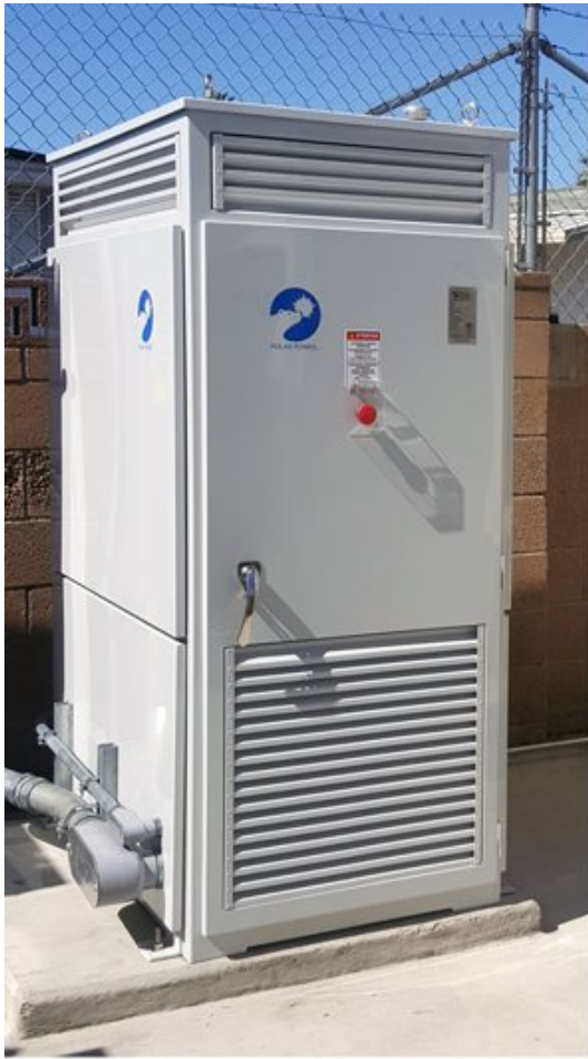
Polar 15 kW diesel backup DC power system