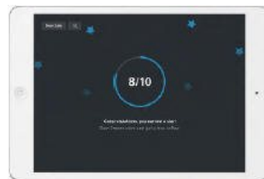
Square Point of Sale manages digital loyalty rewards and integrates with seller customer and sales data. This enables sellers to track key metrics and the impact to their business.

Keva Juice is a Square seller that makes smoothie and juice blends and uses Square's CRM tools in 22 retail locations across the U.S. For Keva, it all starts with the customer: The business uses Square's digital receipts to communicate with customers, allowing Keva to immediately address feedback and "make every customer visit an opportunity to shine." Keva uses Square Point of Sale to manage digital loyalty cards for its 35,000 enrolled customers, helping it avoid the kinds of fraud associated with physical punch cards. Keva switched to Square Gift Cards for the