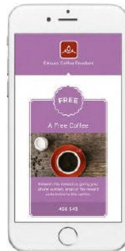
Square Point of Sale also manages the loyalty program for the customer, and loyalty rewards motivate customers to come back again and again.