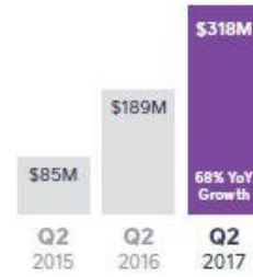
HOW OUR SELLERS USE SQUARE CAPITAL

Based on a January 2017 survey of 7,000 sellers who accepted a loan through Square Capital.