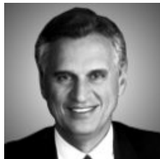
Director of Univar since: 2010 Committees Served: Nominating and Corporate Governance (Chair) Lead Director