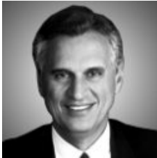
Director of Univar since: 2010 Committees Served: Lead Director