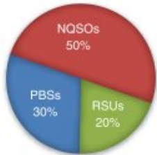
Current Ulta Beauty Annual LTIP Award Mix