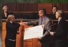
Local Community Giving