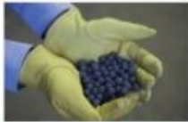
Environmentally Friendly Iron Ore Pellets