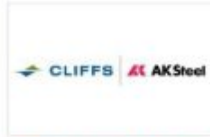
Cliffs to Acquire AK Steel